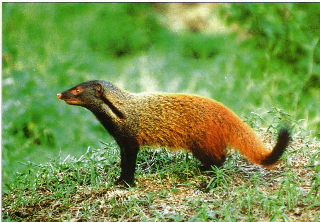
Stripe-necked Mongoose Herpestes vitticollis - Photo: M. N. Jayakumar, IFS, ARPS, AFIAP